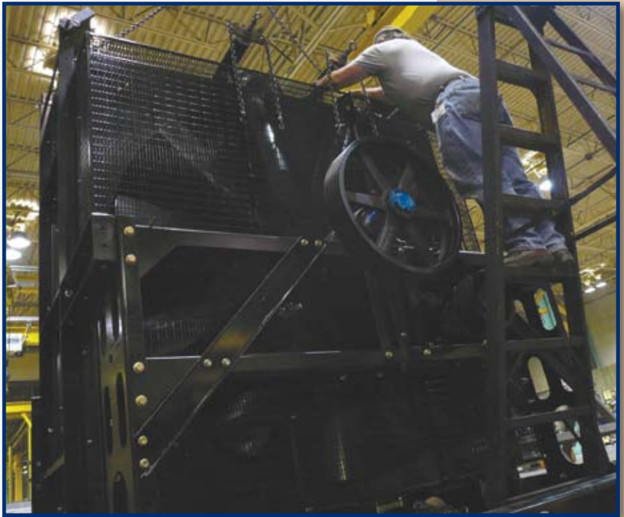
Young Touchstone has CuproBraze heat exchangers in production for locomotive, stationary generator and off-road applications and is preparing for additional customer demand in all of its global markets.

The OEMs mentioned here typically have completed testing and made a decision to use CuproBraze technology. The industry is moving fast. The automotive industry is in a transition phase with new engine technologies in development on several fronts, including spark ignition, diesel, hybrid, electric and fuel cells. CuproBraze technology is also under evaluation for mobile air conditioner (MAC) applications as a consequence of