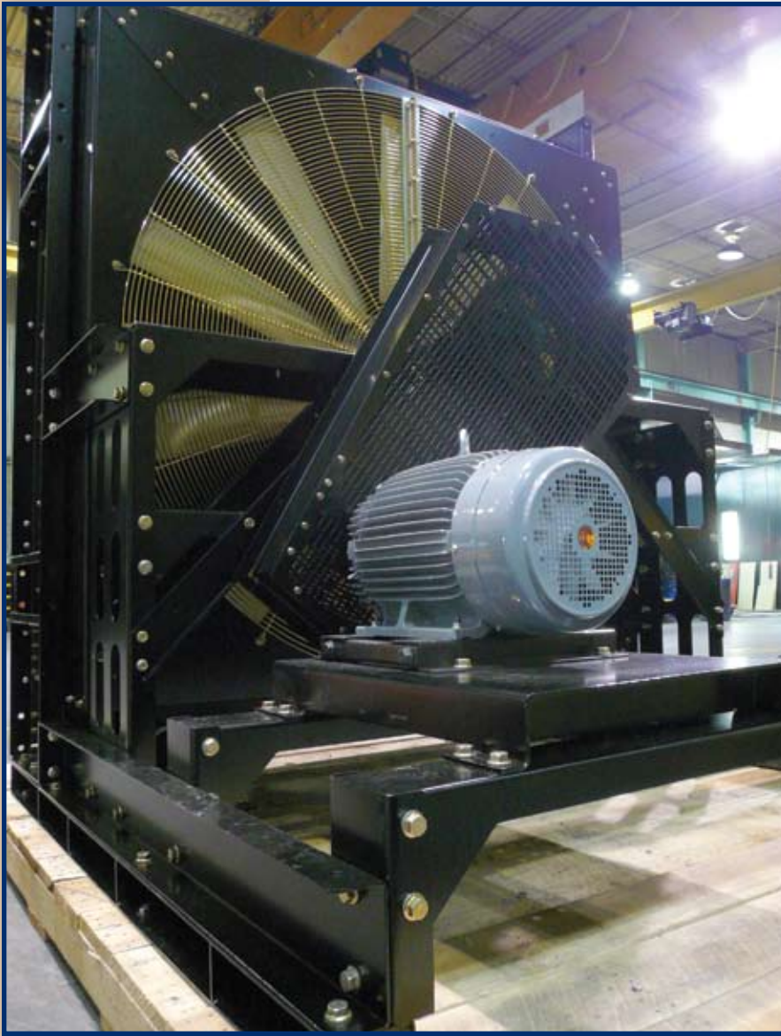
This large heat exchanger contains CuproBraze radiators and charge-air-coolers. Its end use is a generator set rated at 2000 ekW.

in the rail industry with CuproBraze in its future. It will use CuproBraze technology for select diesel locomotives, including its Asia Runner locomotive for South Vietnam and other Asian markets.